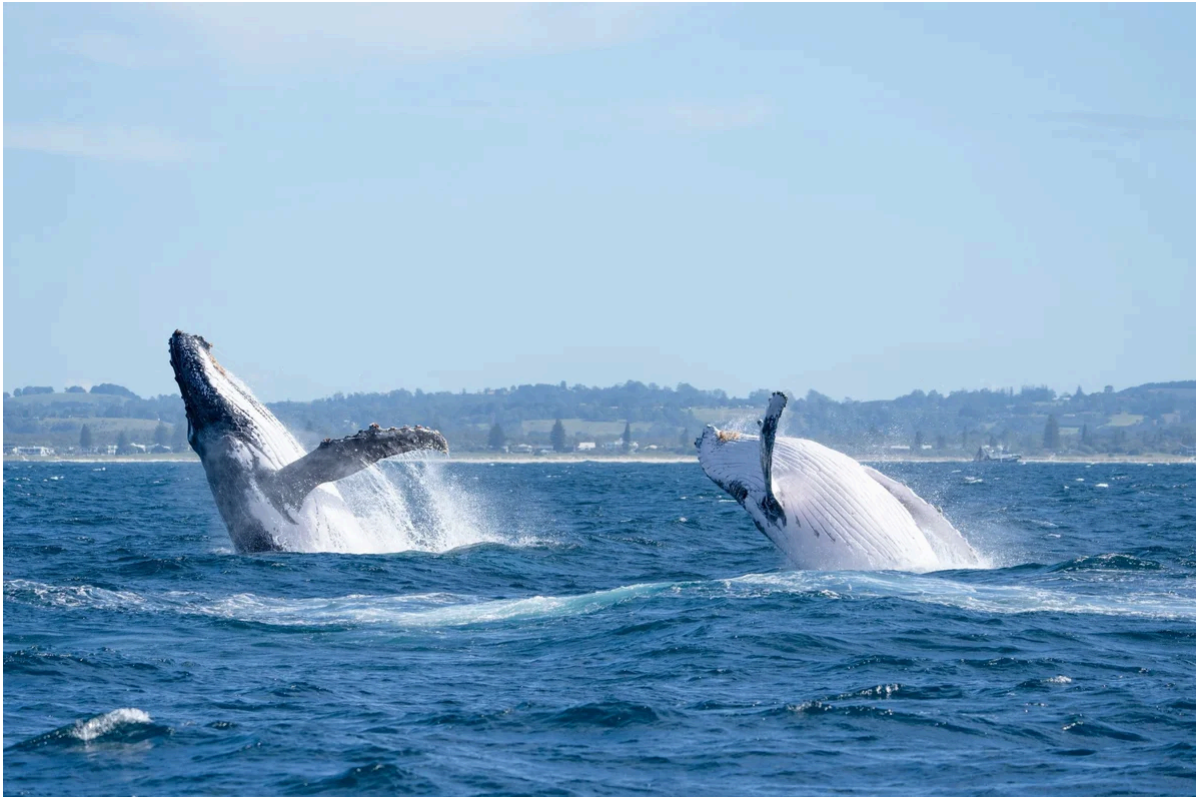
Image: Whale watching with Out of the Blue Adventures, Ballina.