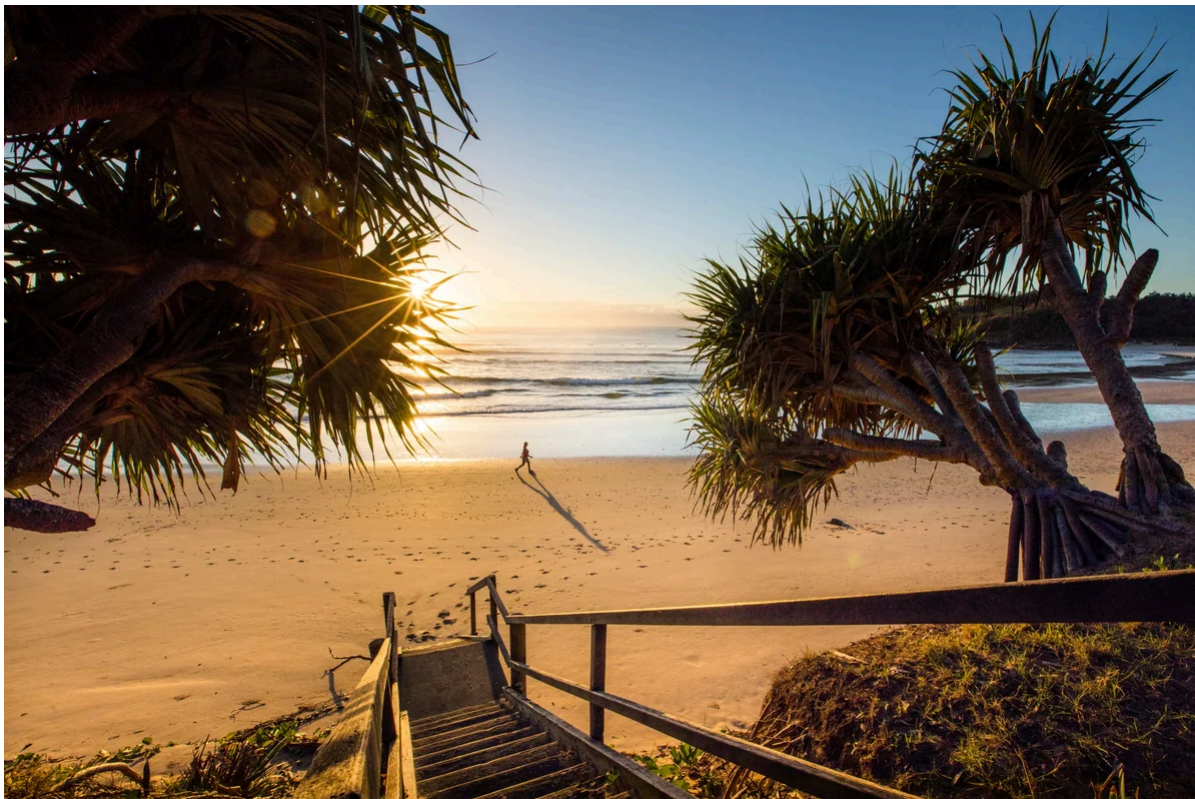
Image: The stunning Coffs Coast will be the backdrop for this year's North Coast Tourism Symposium & Awards.