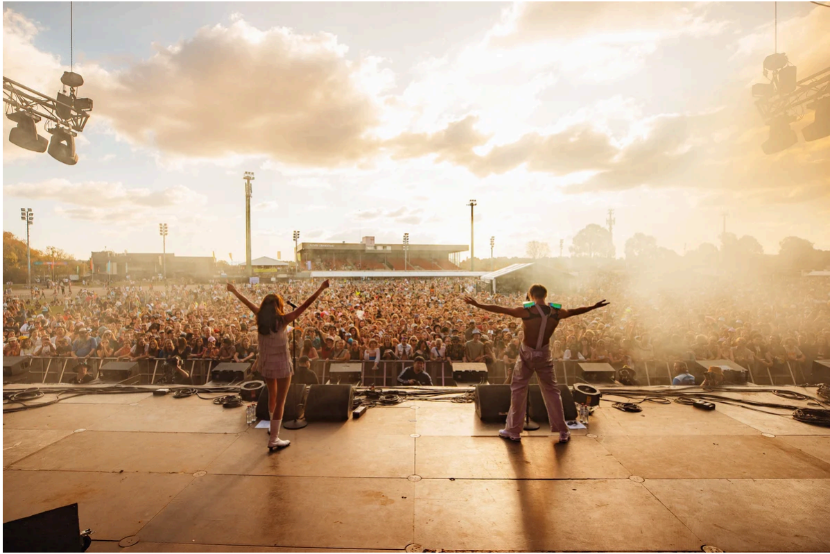
Image: Groovin The Moo hits Lismore on 9 May.