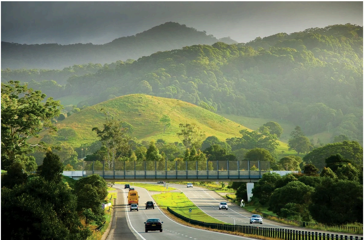
Image: Mount Warning, Northern Rivers.