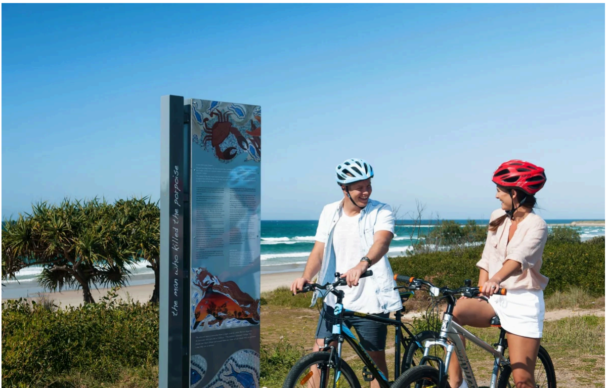
Image: Shared Coastal Pathway at Ballina.