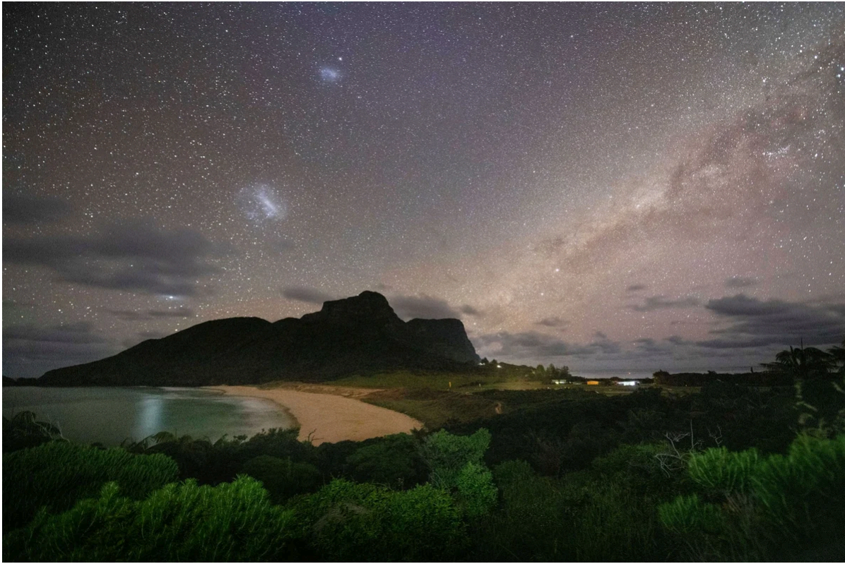
Image: Lord Howe Island starry night.