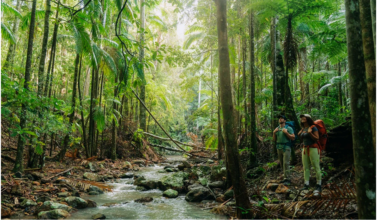
Image: Nightcap National Park.