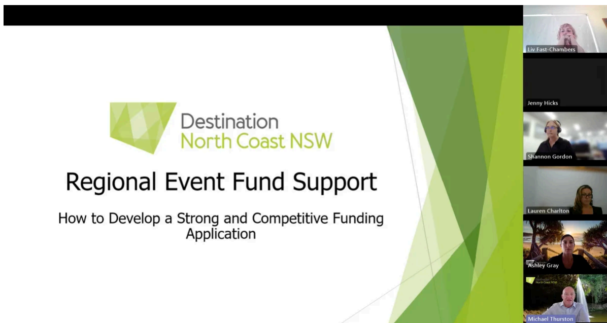
Image: DNC recently held an informative webinar for event organisers interested in the Regional Event Fund.