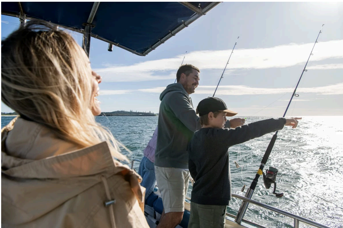
Image: Fozie's Fishing Adventures at Ballina.