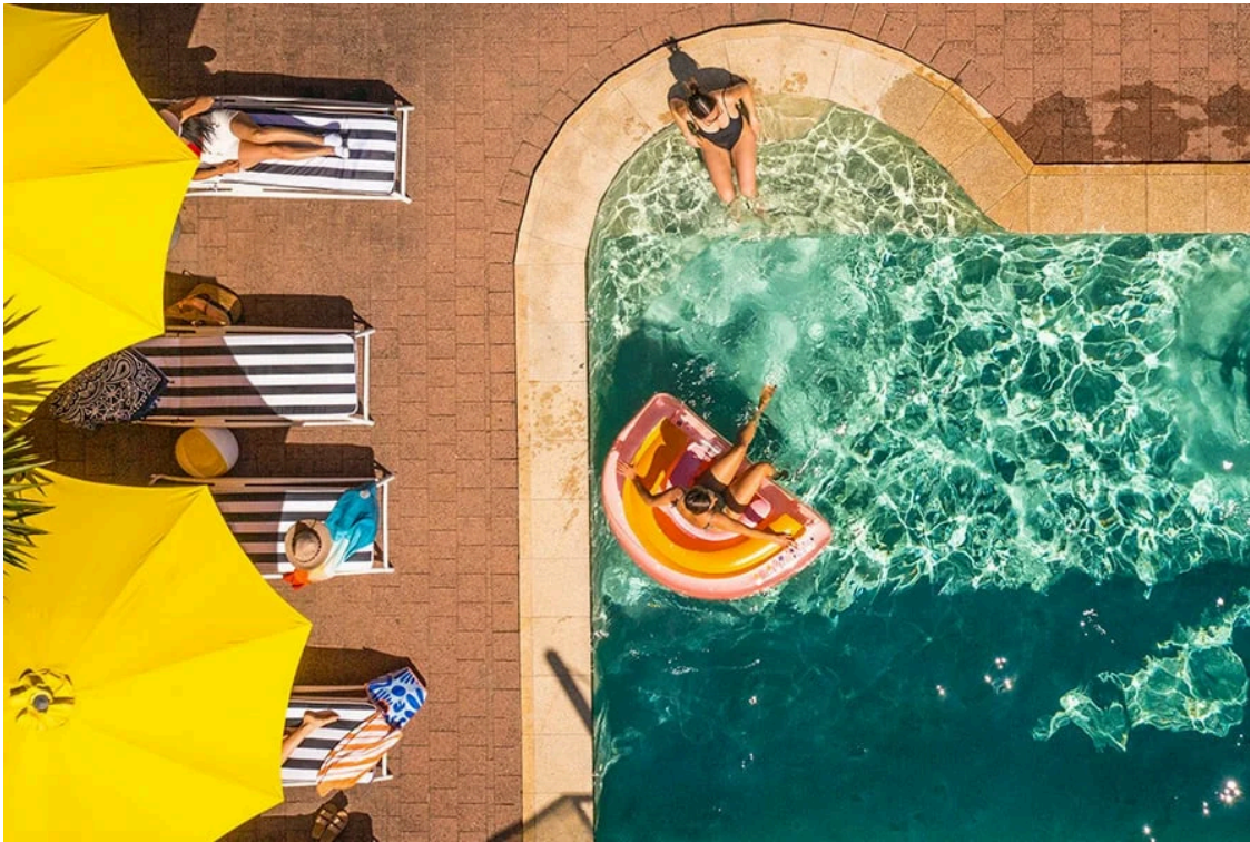
Image: Byron Bay YHA is now fully certified by Ecotourism Australia.