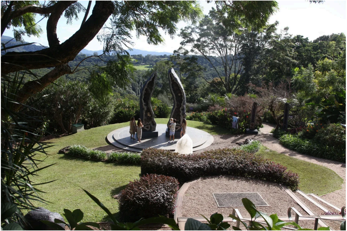
Image: Crystal Castle and the Shambhala Gardens.