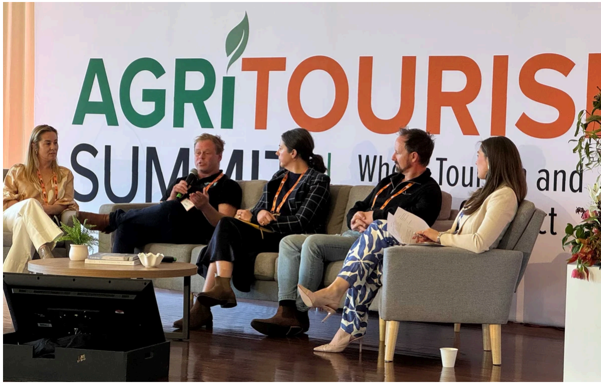
Image: The AgriTourism Summit will expand in 2026 with the inaugural Aqua AgriTourism Summit.