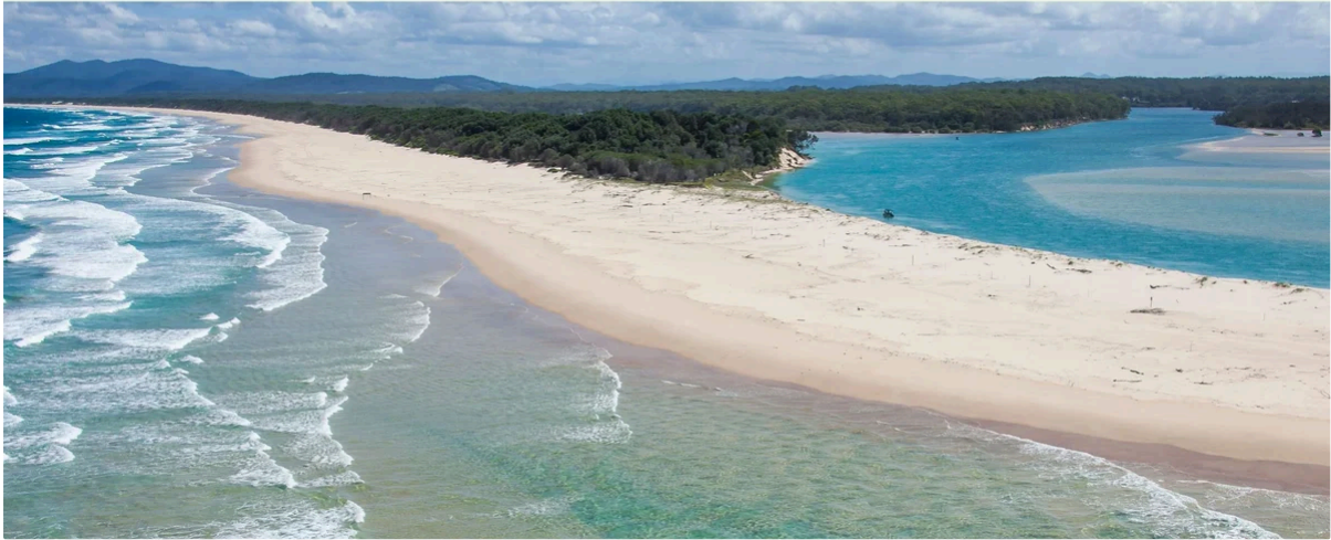
Image: South Beach, Scotts Head.