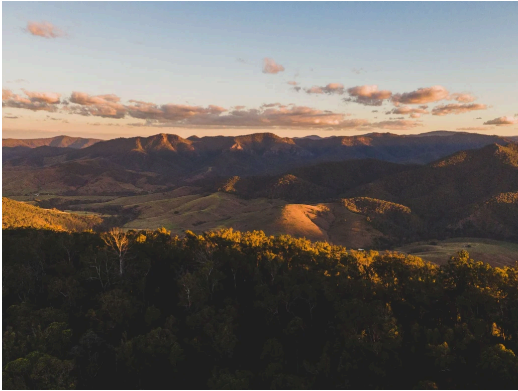
Image: Thunderbolts Way, Gloucester.