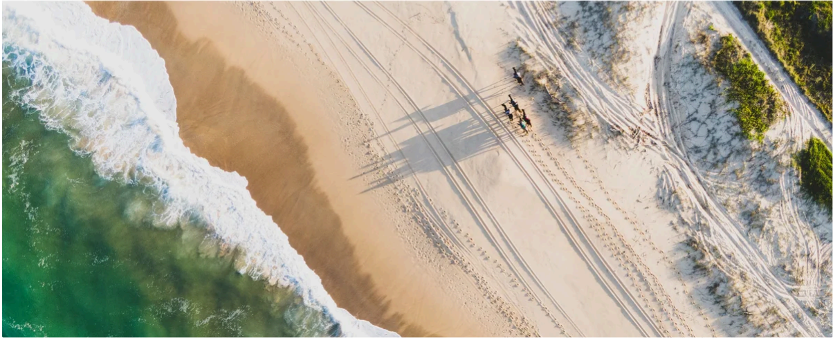
Image: Nine Mile Beach, Tuncurry.