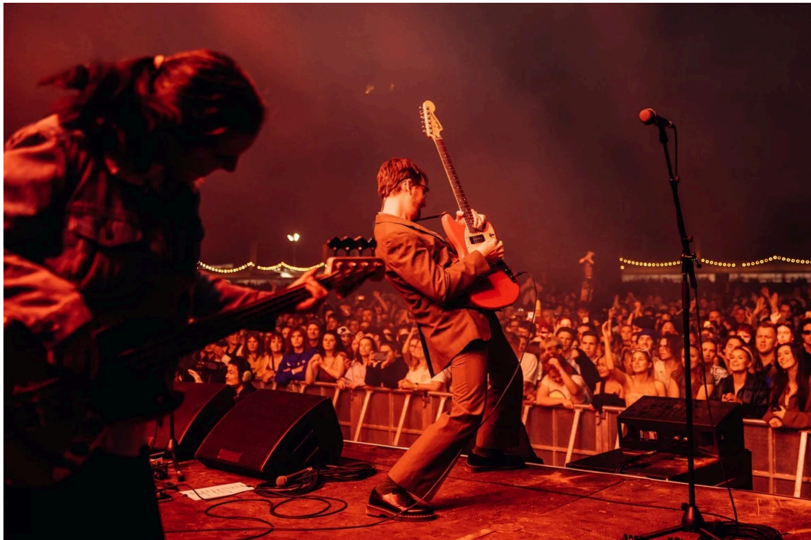
Image: Groovin The Moo.