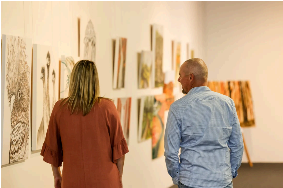
Image: The Slim Dusty Centre, Kempsey.