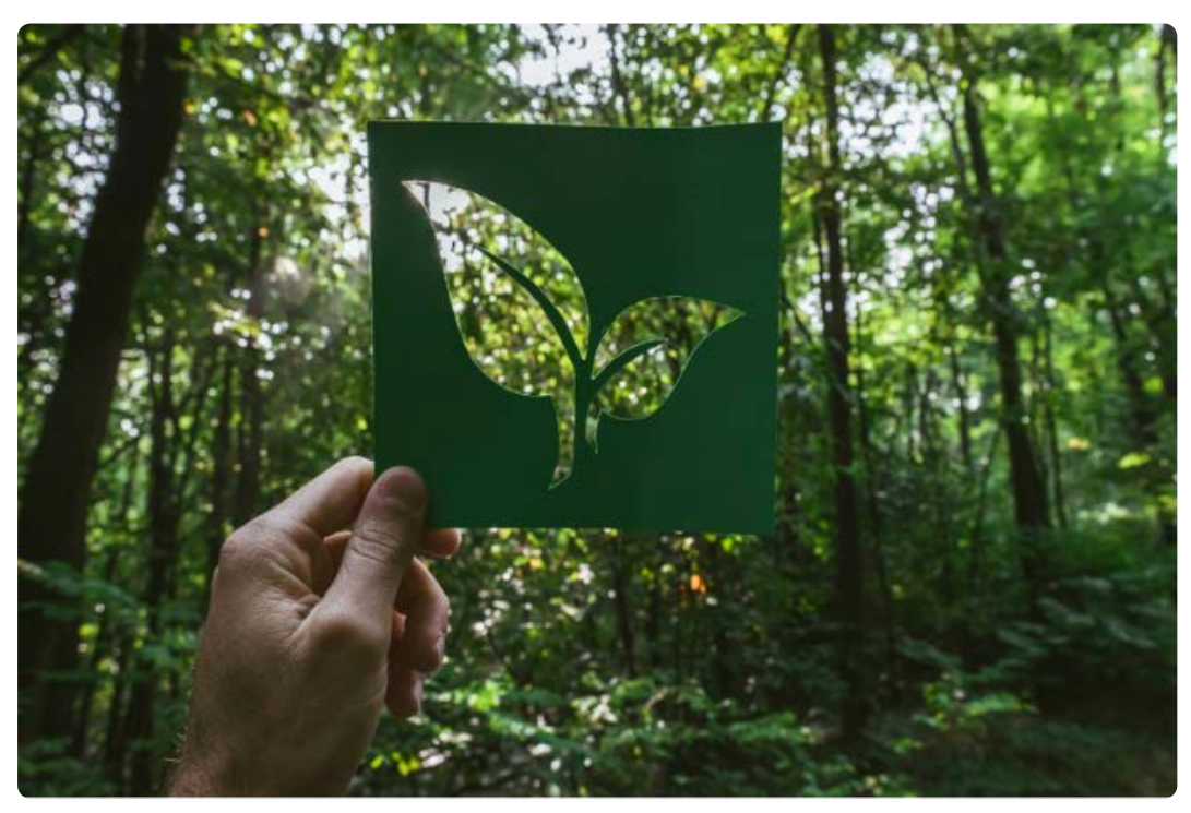
NSW Sustainability Awards Open