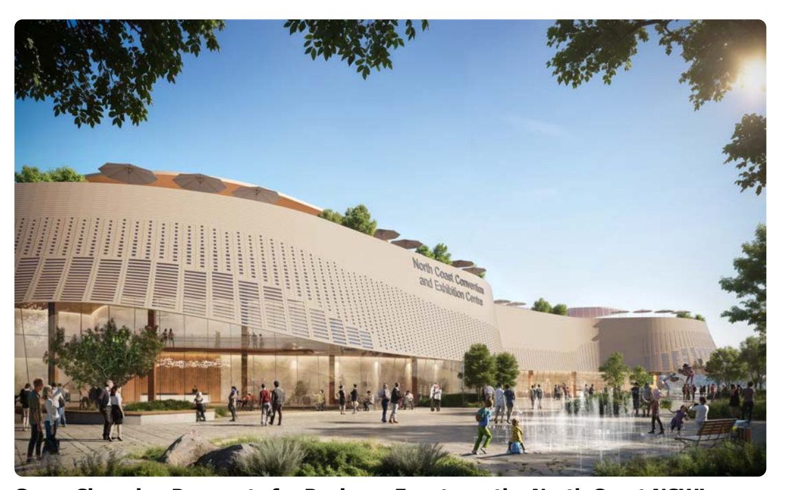
Game Changing Prospects for Business Events on the North Coast NSW!

Destination North Coast commissioned a detailed feasibility study for a North Coast Convention and Exhibition Centre. The report highlights significant opportunities to strengthen our visitor economy and Business Events Market.