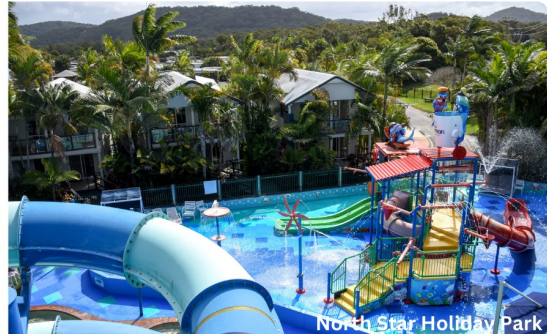
North Star Holiday Park