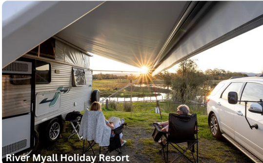
River Myall Holiday Resort

If this is you and you are keen to work with a small but mighty team, please apply here . Applications close at 9am Monday 9th December.