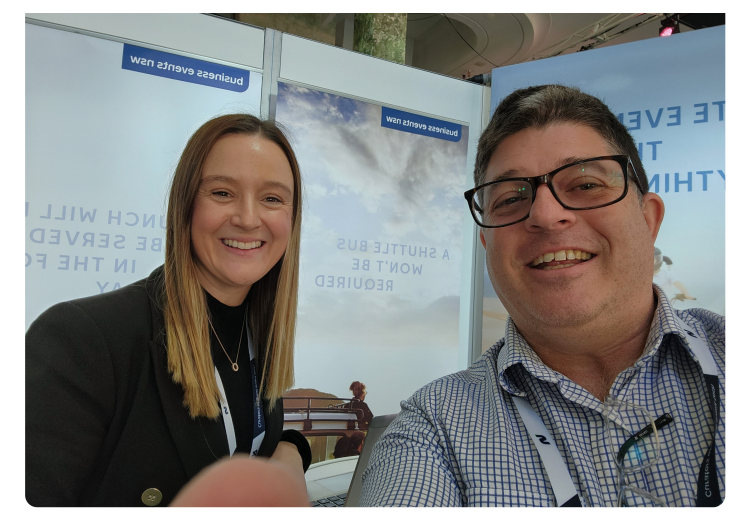
Events Uncovered - Sydney 23 July 2024

Events Uncovered took place at the Museum of Contemporary Art (MCA) at Sydney's stunning Circular Quay on Tuesday 23 July 2024 - a day filled with fresh and innovative trends, suppliers, and venue offerings.