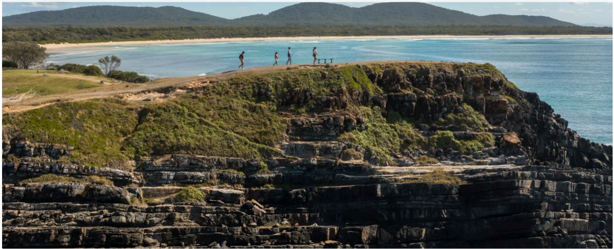
Image: Little Nobby, Crescent Head.